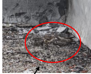
Female & Chick

On July 7th Brett Thelen of AVEO checked the roof of a building on West Street and discovered a nest containing a female nighthawk and one nearly fledged chick!