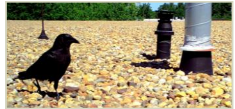
Field camera picture